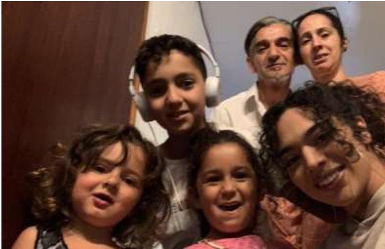
Family Haddad with children and adult daughter. And that's supposed to be unattached?

in photo of the Haddad family from happy days.