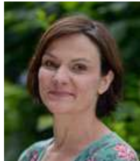
Firmaflexco, Hauptstraße 160, 51465 Bergisch Gladbach, Tel. 02202 26 06 172.