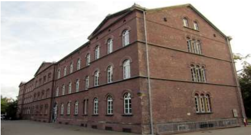
Brauweiler Memorial of the LVM The Use of the Workplace by the Secret State Police – The LPR Yesterday and Today?

Hello the ladies and gentlemen of the LVR clinics in Bonn and the LVR press office,