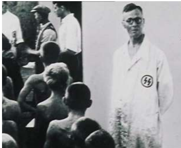
Doctors in National Socialism. The darkest chapter in the history of German medicine. And today again?

Willing doctors, "experts" and psychologists serve the morally reprehensible child abduction of the „Jugendamt“ s and family courts. For most, it's a really good deal. Many of those affected compare this to the National Socialist child molester Dr. Josef Mengele. From May 1943 to January 1945, Mengele was employed as a camp doctor in the Auschwitz-Birkenau concentration camp. In this capacity, he carried out selections, supervised the gassing of the victims and carried out inhumane medical experiments on prisoners and especially on children. As is the case today, the perpetrators were not aware of any guilt. Not knowing anything or acting on orders is the common excuse. A special act of brutalization for the administrative handling of a putian child abduction by the Bergisch Gladbach „Jugendamt“ has now been afforded by the Rhineland Regional Association. The