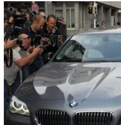
Kachelmann trial by Mannheim public prosecutor's office: Kachelmann in front of cameras "I am innocent" He was acquitted after several months of pre-trial detention.