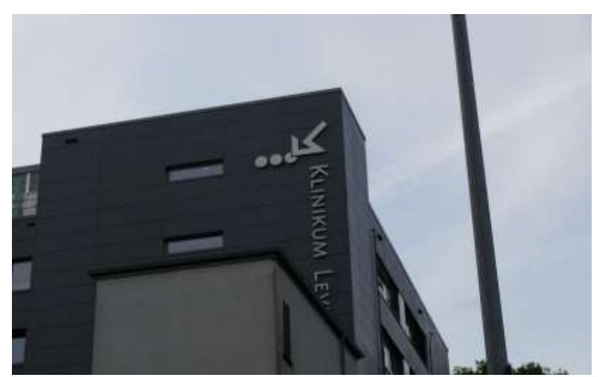
The Leverkusen Clinic is a filthy old building.